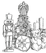
Holiday Craft Fair